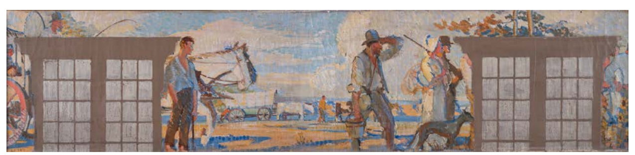
Figure 4. Arthur Sinclair Covey, The Spirit of Kansas , preparatory maquette for "Promise," 1914; oil on canvas, collection of Southwest College, Winfield, KS.