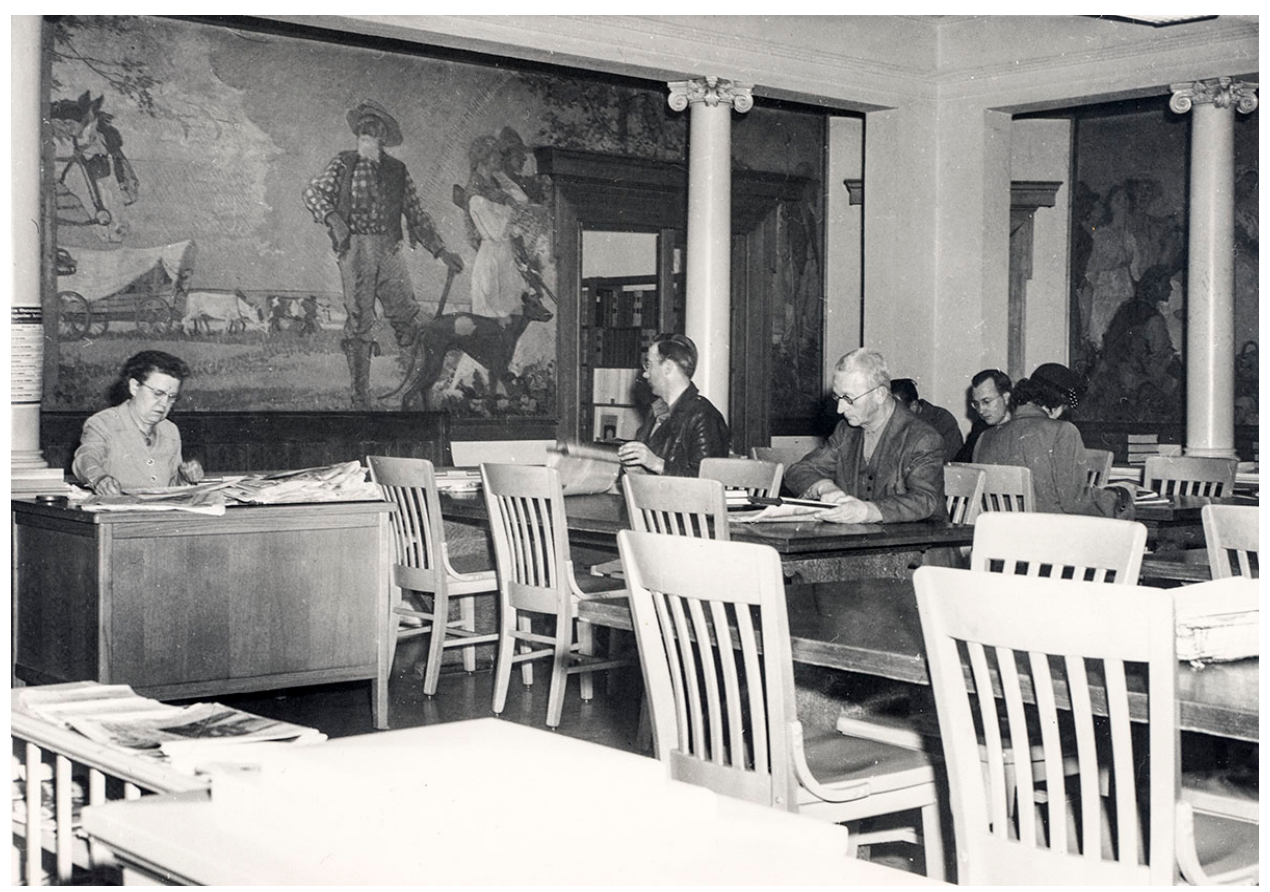
Figure 2. Wichita City Library reading room, ca.1949; Wichita Public Library Photograph Collection, wpl1414.