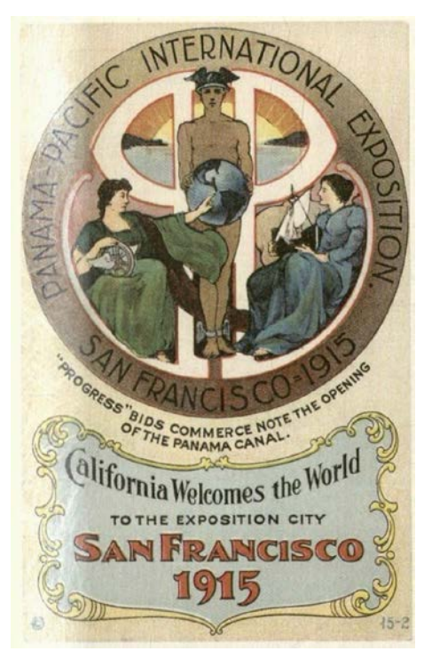
Figure 10. Postcard from "California Welcomes the World" series, Panama-Pacific International Exposition, 1915; image from Moore, Empire on Display , p. 137.