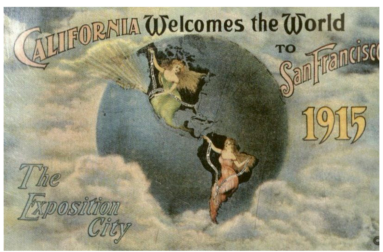
Figure 11. Postcard from "California Welcomes the World" series, Panama-Pacific International Exposition, 1915; image from Moore, Empire on Display , p. 137.