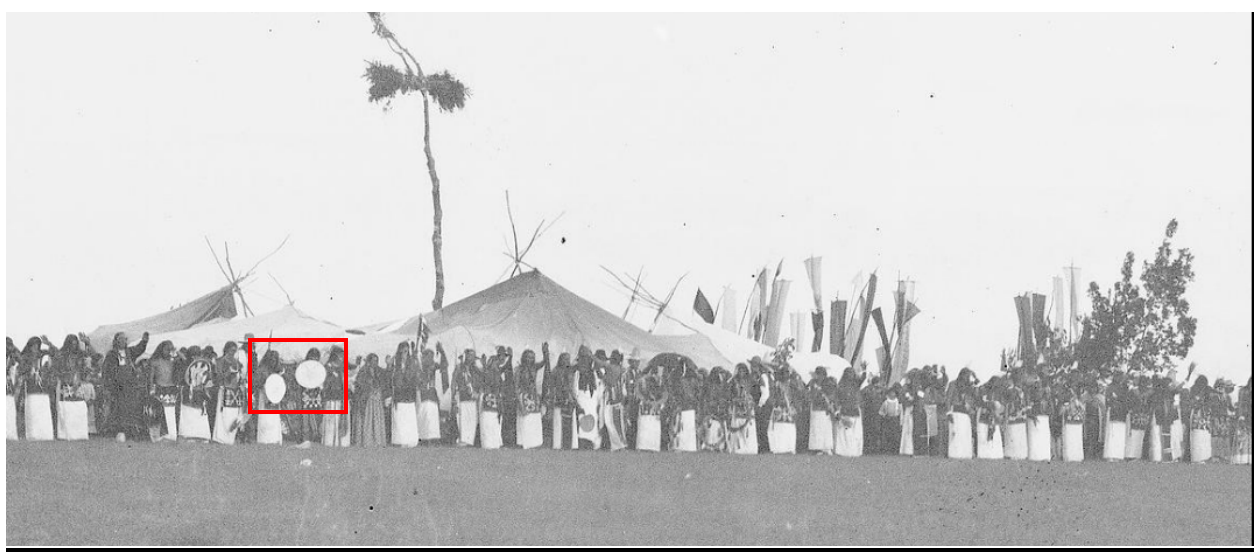
Figure 16 . George Amos Dorsey, "The dance to the setting sun, third day," 1905 (detail, with red frame added around men holding medicine shields); silver nitrate negative, Photo Lot 89-8 OPPS NEG 1650, National Anthropological Archives, Smithsonian Institution.