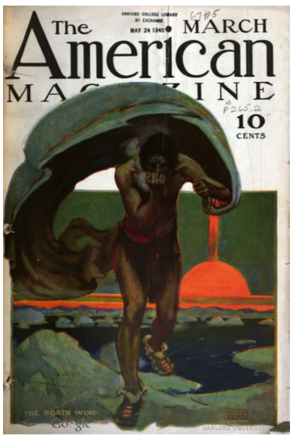
Figure 14. Arthur Sinclair Covey, The North Wind , cover for The American Magazine , March 1909; image from HathiTrust.