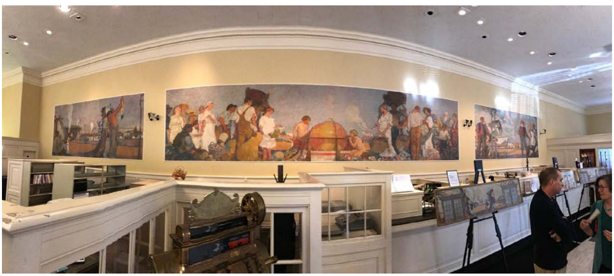
Figure 1. Arthur Sinclair Covey, The Spirit of Kansas, 1915, oil on canvas; photographed in 2017 at Southwest National Bank, Wichita, KS.