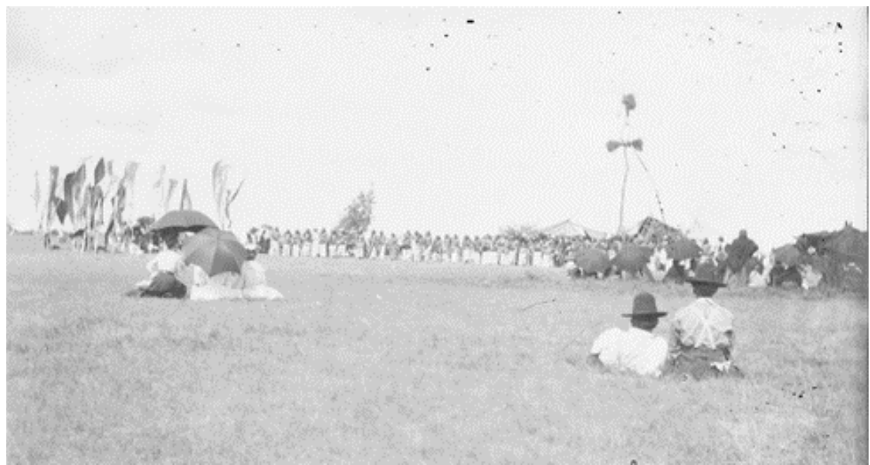
Figure 15. George Amos Dorsey, "Beginning of dance, outside the lodge," 1905; silver nitrate negative, Photo Lot 89-8 OPPS NEG T1635, National Anthropological Archives, Smithsonian Institution.