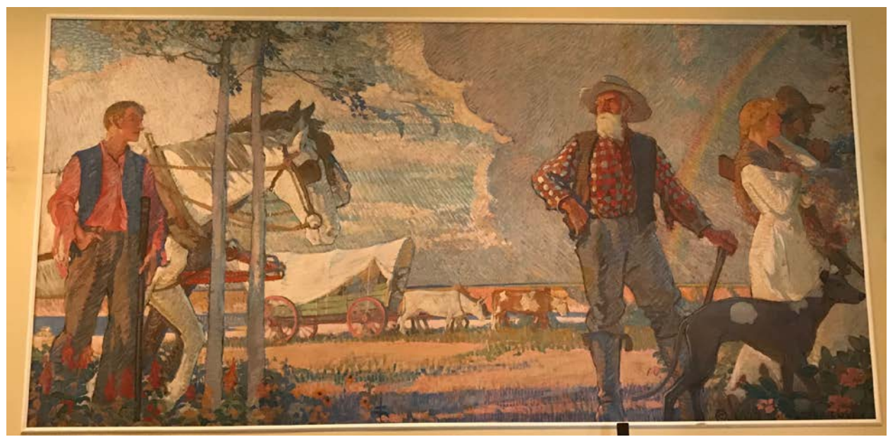
Figure 3. Arthur Sinclair Covey, The Spirit of Kansas , Panel 1: "Promise," 1914-15; oil on canvas, Southwest National Bank, Wichita, KS.