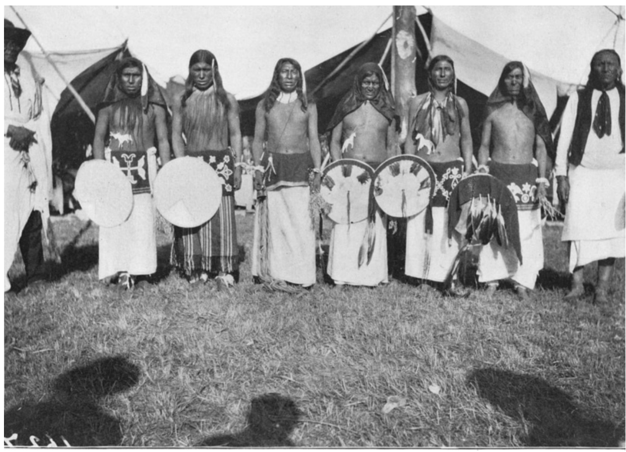
Figure 18. George Amos Dorsey, "General view of camp and Sun dance lodge, fourth day," 1905; from Dorsey, "The Ponca Sun Dance," plate XXX.