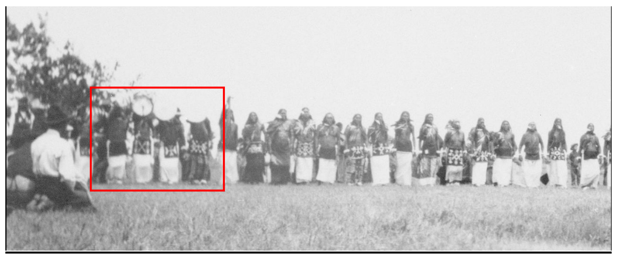
Figure 17 . George Amos Dorsey, "The dance to the setting sun, third day," 1905 (detail, with red frame added around men raising medicine shields); silver nitrate negative, Photo Lot 89-8 OPPS NEG T1622.