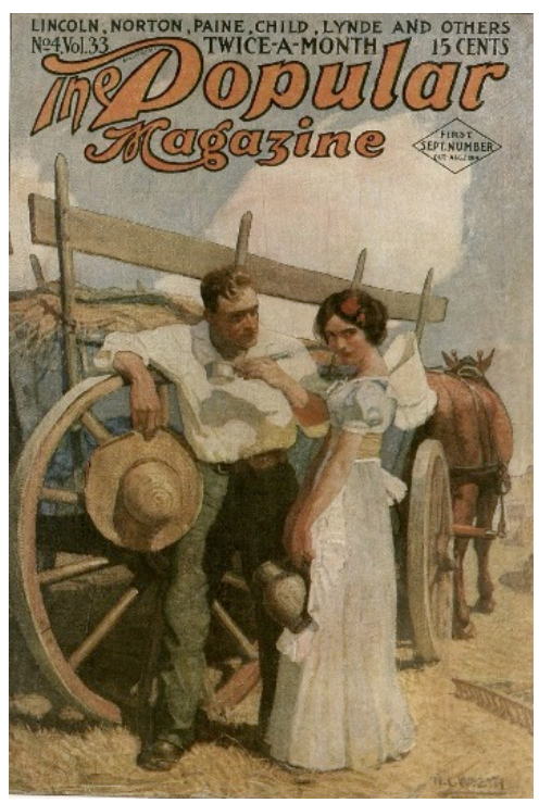
Figure 6. N.C. Wyeth, cover for The Popular Magazine , September 1914; image from Menges, N.C. Wyeth: Great Illustrations , p. 53.