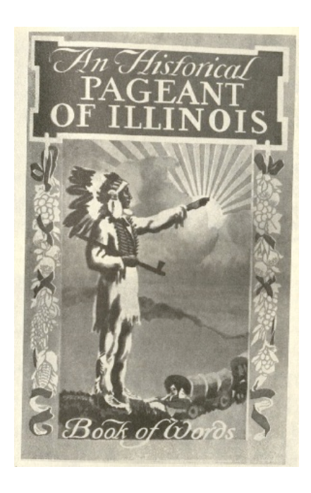
Figure 8. Program cover, An Historical Pageant of Illinois (Evanston, IN), 1909; courtesy of Brown University Library.