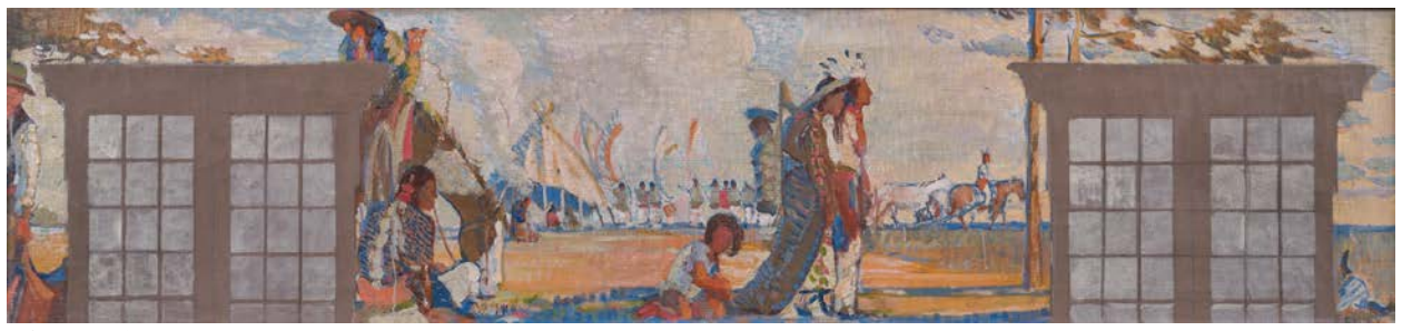
Figure 13 . Arthur Sinclair Covey, The Spirit of Kansas , preparatory maquette for "Afterglow," 1914; oil on canvas, collection of Southwest College, Winfield, KS.