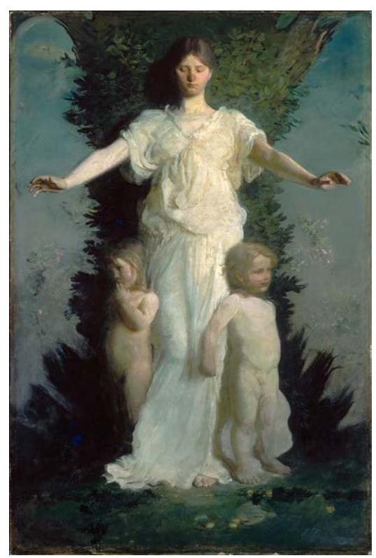
Figure 7. Abbott Handerson Thayer, Caritas , 1894-95; oil on canvas, 85.25 x 55.25 in., Museum of Fine Arts Boston.