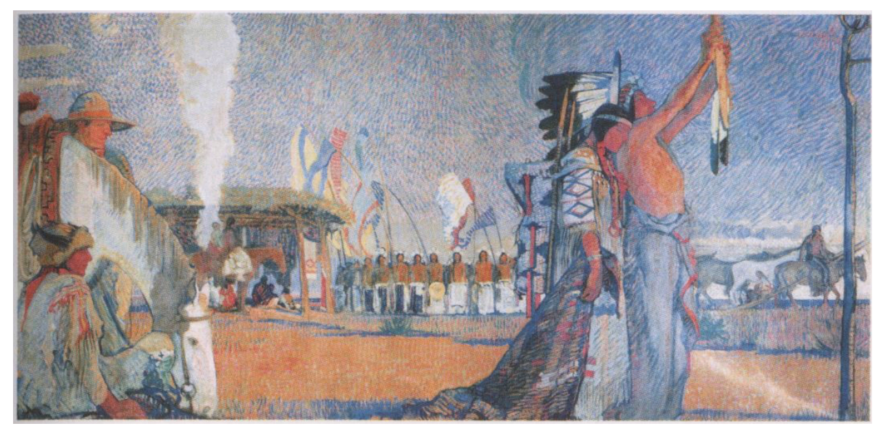
Figure 12. Arthur Sinclair Covey, The Spirit of Kansas , Panel 3: "Afterglow," 1914-15; oil on canvas, Southwest National Bank, Wichita, KS.