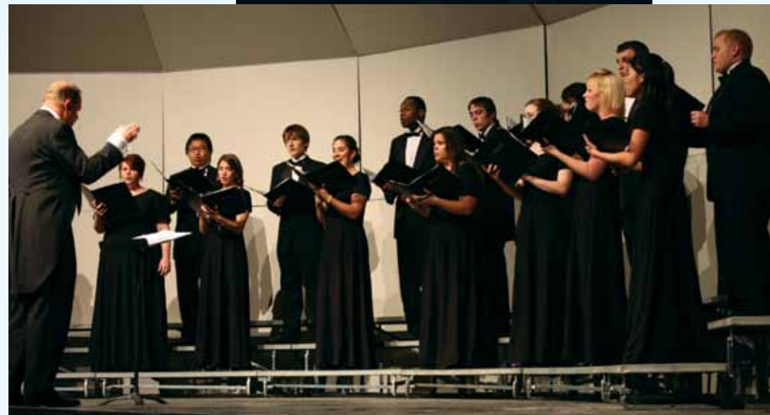
Nine Lives improv ( top ), Southwestern Singers ( below ), choir, orchestra, and band music turned the spotlight on performing arts.