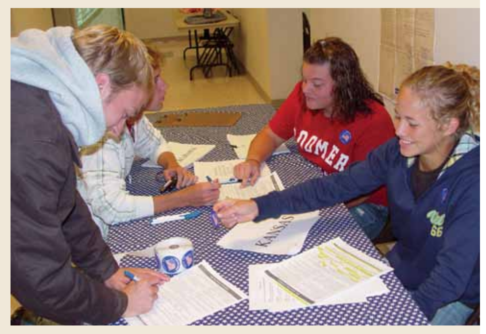
Student volunteers help with registration paperwork before the Nov. 4 elections. The effort resulted in 181 new voters on campus.

"Patience is a virtue," he says with a laugh, "and until then, I can still be part of the process."