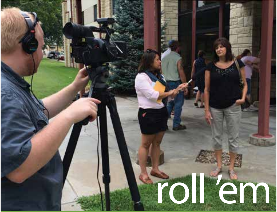
A film crew from the United Methodist Church's General Board of Higher Education and Ministry participated in freshman orientation and Builder Camp along with new freshmen. The resulting video will be used in highlighting how a United Methodist college integrates new students into campus life. Watch Southwestern's Facebook page for announcement when the video is available for viewing.