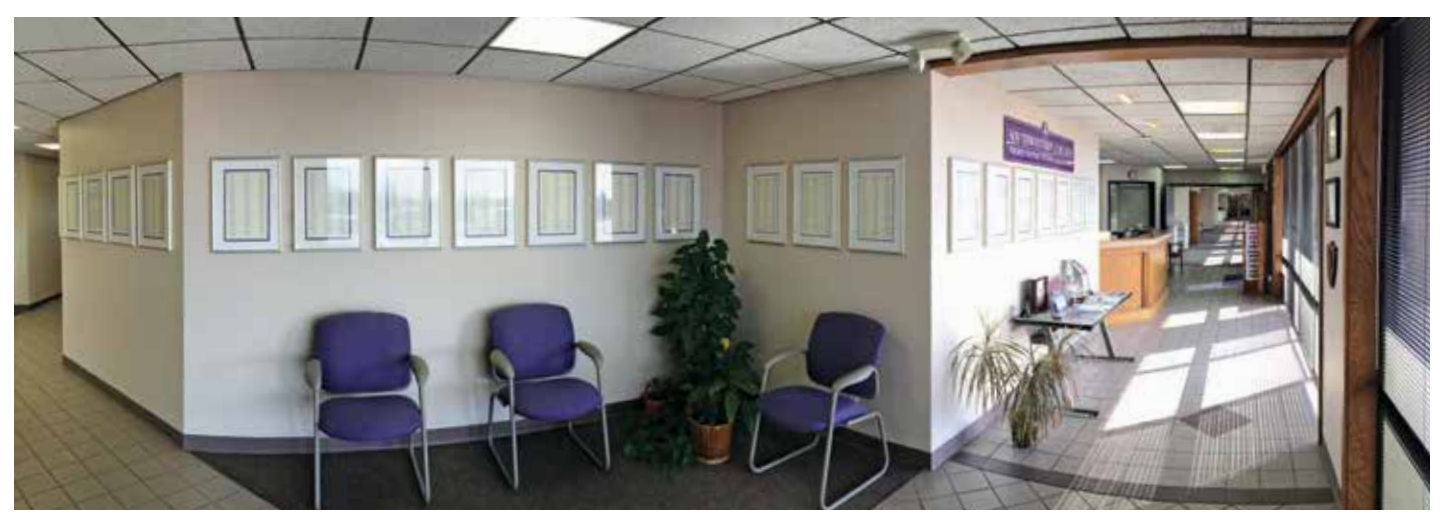
The lists of Professional Studies graduates since the program began in 1994 lines the walls in Wichita's East Center, and includes more than 5,000 names.

courier service. We all shared one email address at the time."